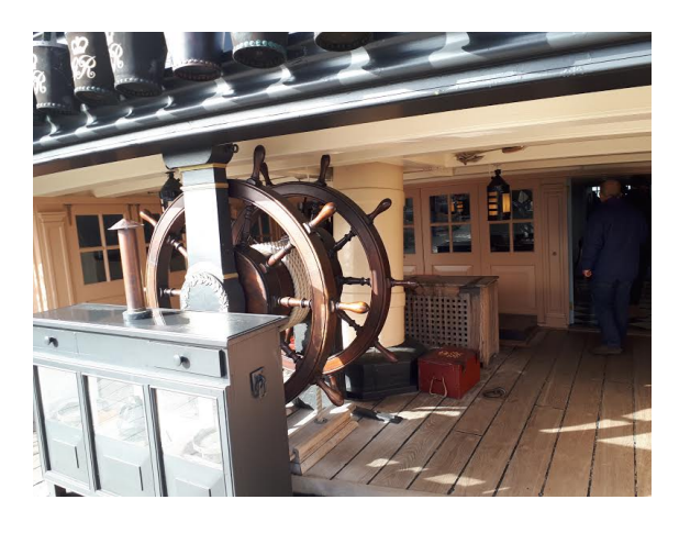
The helm on the quarter deck, under the shelter of the poop deck.

We are online at <u>nbpss.on.ca</u> or on Facebook.