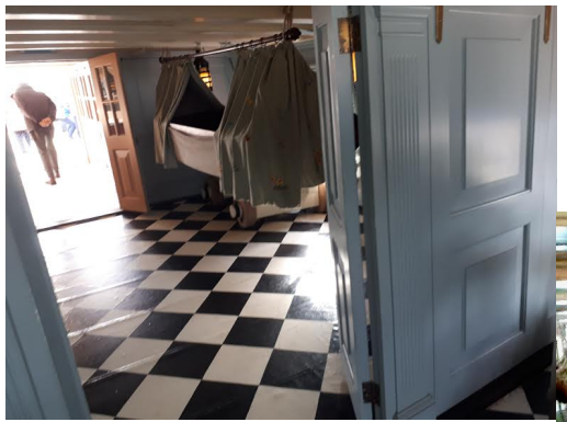
Admiral Nelson's sleeping area (above) vs. crew's sleeping area (right)